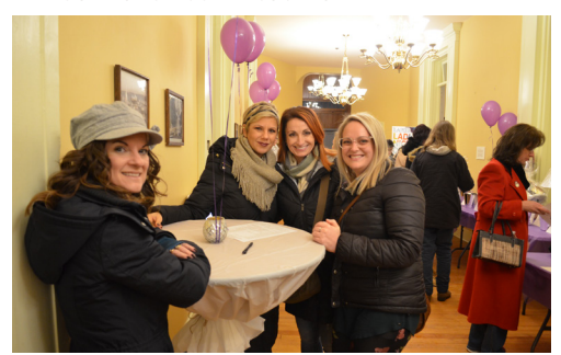
A Ladies Night Out in historic Lapeer