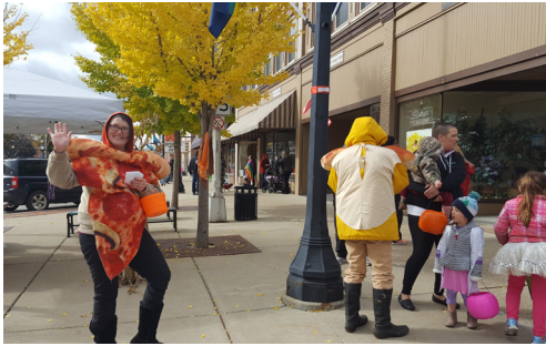
Annual Halloween Treat Walk