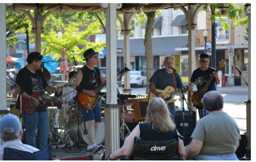
Summer Concert Series